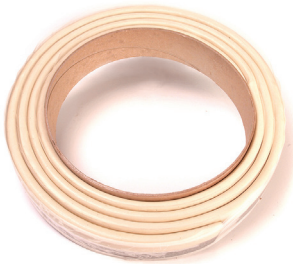
Colorseal-On-A-Reel provides a 10-ft (3m) length on a single reel.

Sealant-coated, precompressed, primary seal for rapid installation into small joints in vertical and horizontal planes.